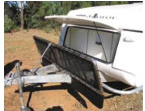
Clockwise from bottom left: A roof-mounted flatscreen TV allows more bench space; well designed and practical layout; four-person cafe style dinette; a stainless steel stone shield is mounted in front of a storage bin.